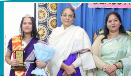
Crowning Ms. GDPS

reflects dedication, discipline and determination. To our students, I say: Believe in yourself. Embrace challenges as opportunities. Never fear failure, for it is often the stepping stone to success. Let your curiosity lead you, your values guide you and your hard work define you. As an institution committed to preparing students for tomorrow, we strongly believe in 'Artificial Intelligence for All'. This means that every student and teacher should have the opportunity to understand, explore and responsibly use AI. When used wisely, AI can enhance creativity, improve learning experiences and help us discover innovative solutions to real-world challenges. Dear students, remember that technology is most powerful when combined with imagination, hard work and integrity. Use AI not just as a tool for answers, but as a means to ask better questions, explore new ideas and contribute positively to society. Let us move forward together with confidence, curiosity and a shared vision of learning that is inclusive, innovative and future-ready. God bless you all