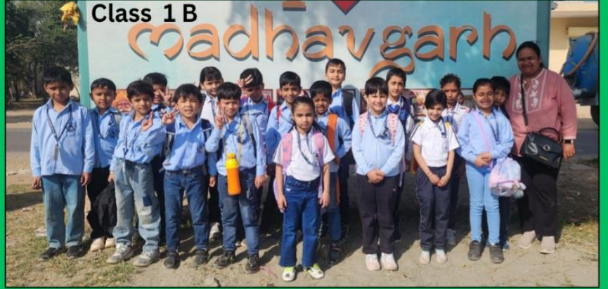
Class 1 B