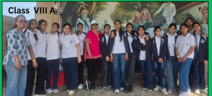
Class VIII A