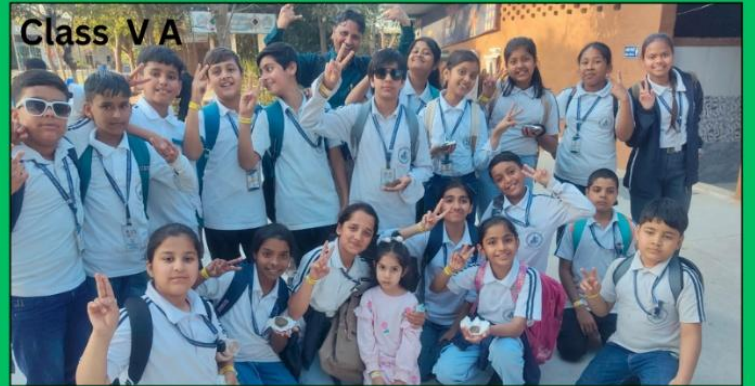
Class V A