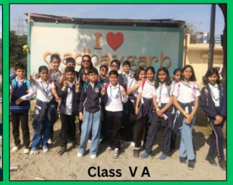
Class V A