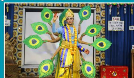
Play - 'The Arrival of Kalki'