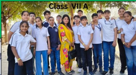
Class VII A