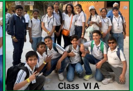
Class VI A