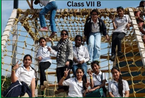
Class VII B