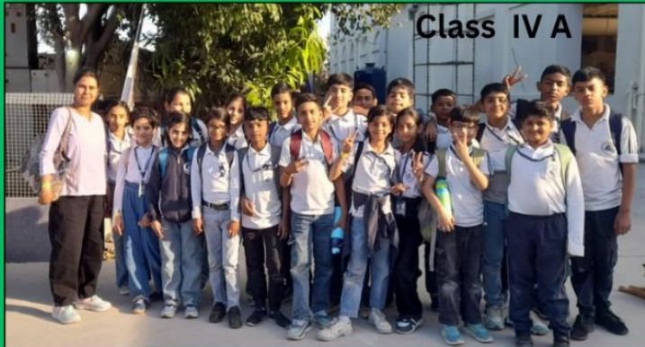
Class IV A