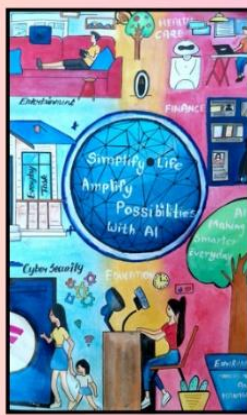
Srishti (Class X)