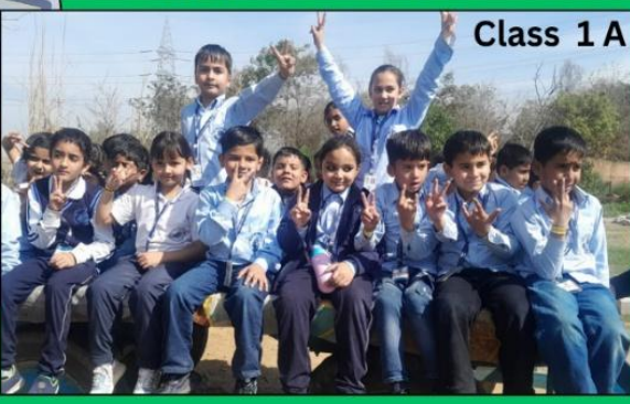
Class 1 A