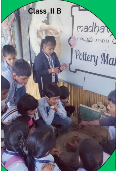
Class II B