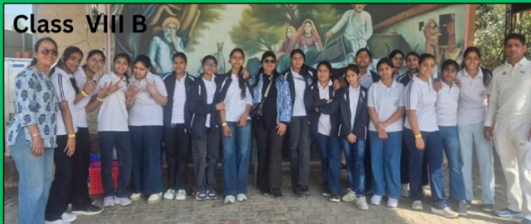
Class VIII B